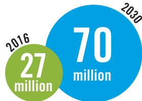
Number of Americans affected by osteoarthritis now and by 2030